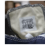
INSIDE SIZE TAG