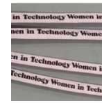
LACES WITH TEXT