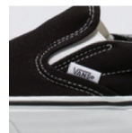
OUTSIDE LOGO TAG