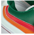
SEWN ON PATCHES