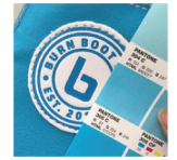
SEWN ON LOGO PATCH