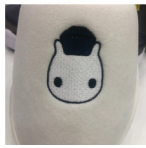
EMBROIDERY LOGO - FUZZY SLIPPERS