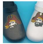
NO HOLES CLOGS