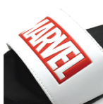
SUPER EMBOSSED LOGO