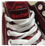
OUTSIDE SHOE TAG