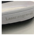
LASER ENGRAVED SOLE