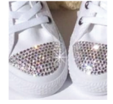
BEJEWELED TOE CAP