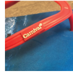
LOGO ON STRAP