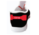
COLORED BACK STRAP